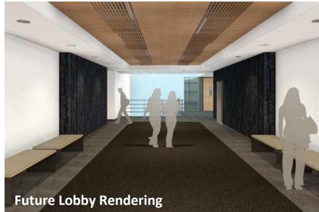
Future Lobby Rendering